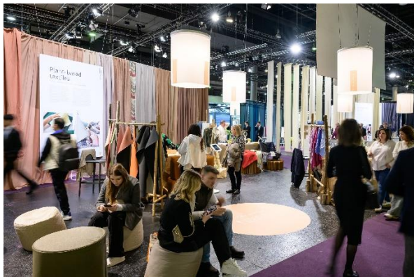
Heimtextil: Hotspot for textile Interior Design.

In addition, the latest trends, developments and products relating to sleep await visitors in the immediate vicinity in Hall 11.0. The Smart Bedding area is the central platform for innovative sleep systems, bedding and duvets, pillows, mattresses and machines for textile processing. Returning exhibitors such as Billerbeck (Switzerland), KBT Bettwaren (Germany), Setex Textil (Germany) and Grasm Industries - Aditya Birla (India) as well as exhibitors such as Hefel Textil (Austria), John Cotton Europe (Poland), Lenzing AG (Austria), OBB (Germany), Standard Fiber (USA) and Traumina (Germany) will present their wide range of products here.